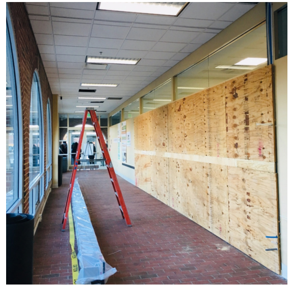
Early construction phase of the living wall.