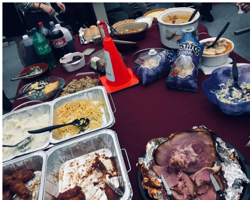
What a spread!