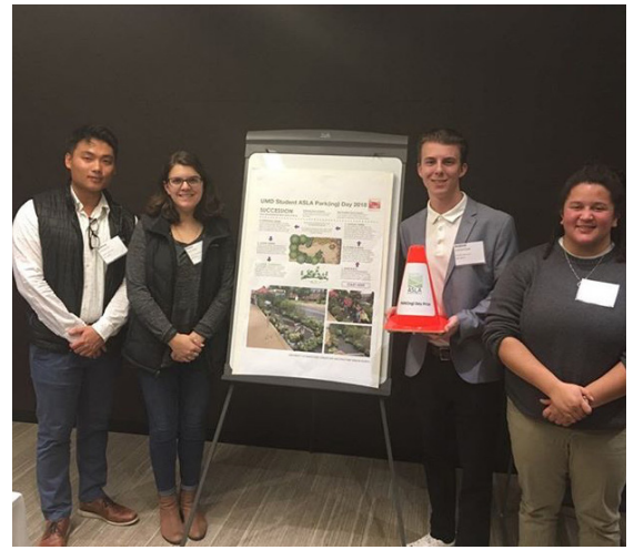
UMD Student ASLA Executive Members accept the contest award