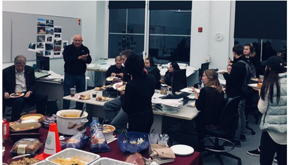
Full stomachs and happy students at the Student ASLA Thanksgiving Potluck

LABash 2019 April 4 th -6 th University of Georgia Help Send Us to LABash! Donate Here