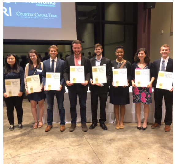
Congratulations students award winners!