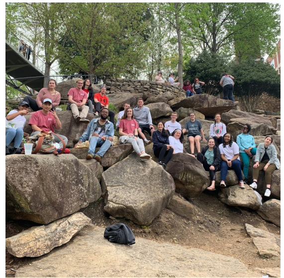
The LABash group kickin' back mid-road trip at Falls Park in Greenville, South Carolina.

Over the recent years, there have been many steps made to strengthen the ties between our alumni and current students. The Alumni Council has played an integral part in this growth and deserve thanks for their efforts to building up and supporting our students.