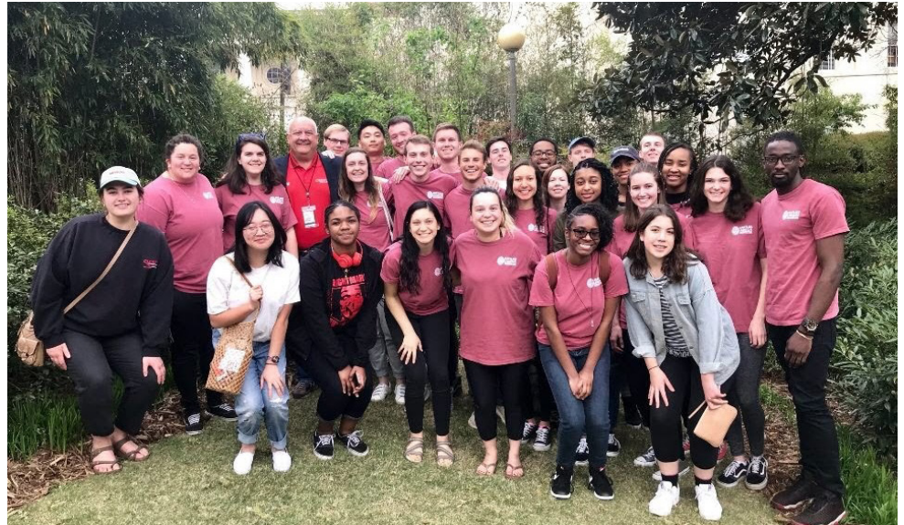
30 UMD students attended LABash2019 at the University of Georgia this spring!

ASLA Conference on Landscape Architecture San Diego, California Information Here