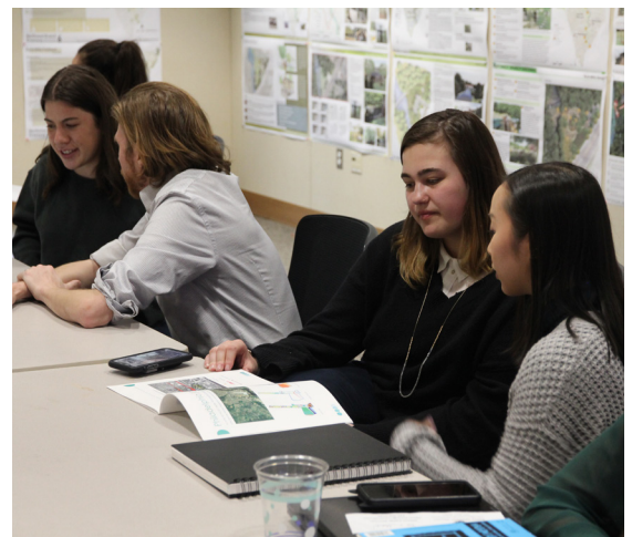
Alumni reviewing the work and portfolios of rising seniors during a meet and greet.